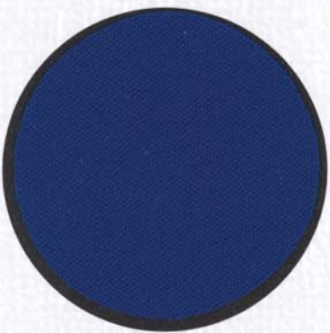
MED. BLUE 715