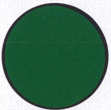
DK. GREEN 614